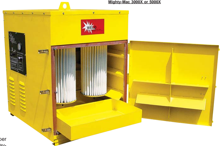
Mighty-Mac 3000X or 5000X