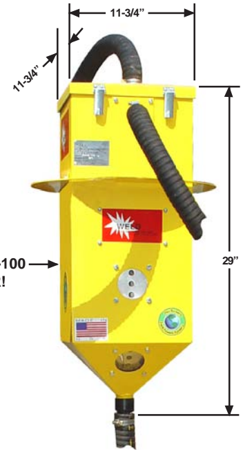
FHMV5-100 FLUX HOPPER. 100 LB. CAPACITY. WILL FIT 16" ROUND MOUNTING HOLE.

EASY DUST CLEANING. SHAKE BAG, PULL OUT DUST PAN AND EMPTY. FLASHING LIGHT TELLS YOU WHEN TO CLEAN.